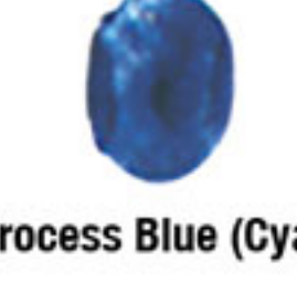
Process Blue (Cyan)